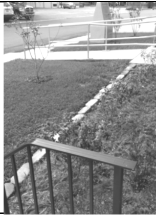
(Front of Rectory—4 Crepe Myrtles, dwarf red Knockout Roses, and dwarf gardenia bushes.