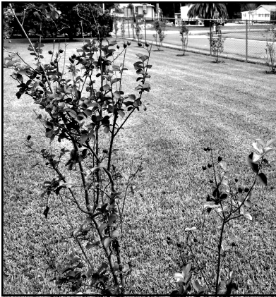
(L) Front side yard - 16 Crepe Myrtles.