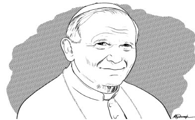
St. John Paul II

WORLD MISSION COLLECTION TO BE TAKEN UP AS THE SECOND COLLECTION AT ALL MASSES ON OCTOBER 19TH & 20TH.