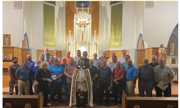
Man of God Conference was held August 22, 2024. The next Conference is scheduled Thursday, December 5, 2024.