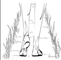
© I.S. Pabst Co., Inc. — Hebrews 12:12-13

Strengthen your drooping hands and your weak knees. Make straight paths for your feet, that what is lame may not be disjointed but healed.