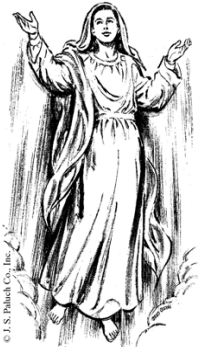
Assumption of the Blessed Virgin Mary

Come and be a part of an organization that keeps our church beautiful. Flyers and registration forms are available in the rear of church. Dues of $8.00 a year can be paid at the Annual Covered Dish Supper, Wednesday, August 22, 2018 at 6:00 p.m. in the cafeteria.