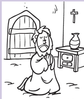
Ash Wednesday • Matthew 6:1-6, 16-18

When you catch someone in sin (stealing, lying, using hurtful words) be kind. Remember your own sins, and show God's forgiveness.